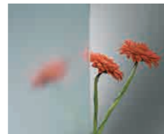
Linea Azzurra Slightly blue tinted float base