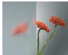
Clear Normal float base