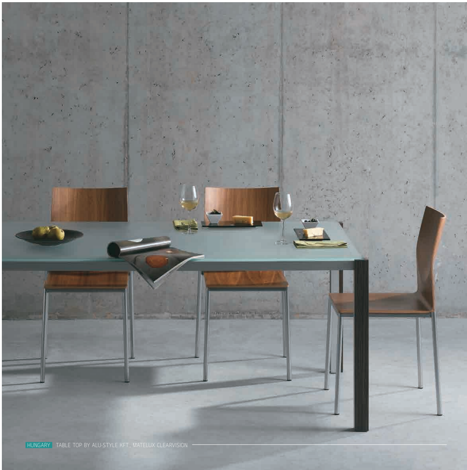
HUNGARY TABLE TOP BY ALU-STYLE KFT., MATELUX CLEARVISION