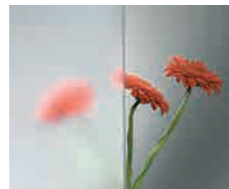
Clearvision Highly transparent float base for pure aesthetics