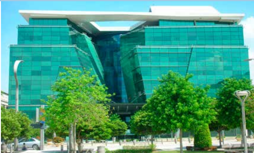
Putrajaya 3C4 - Putrajaya - Malaysia - Stopsol Classic Green

Never write on the coating of the glass. Moreover, no cutting tools, pointed tools or hard tools that could damage the coating should be used.