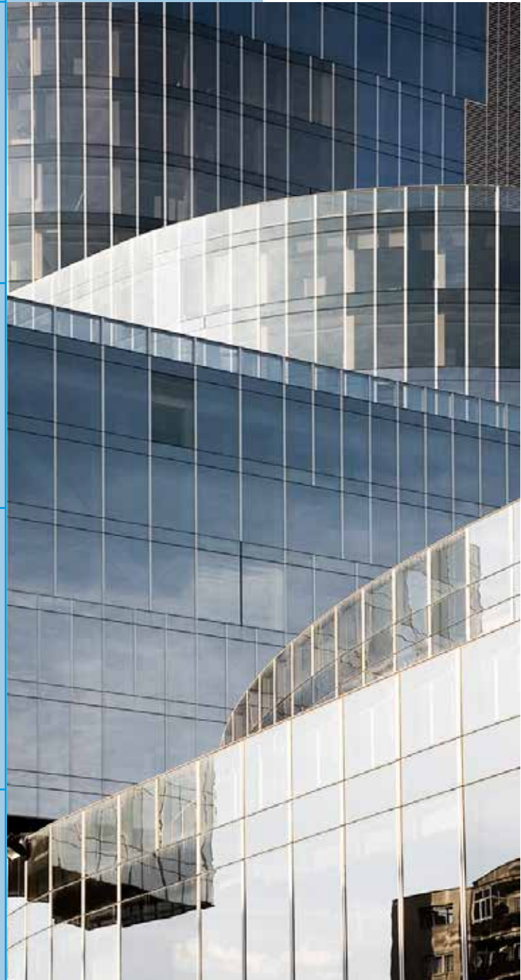
Torre Gas Natural - Barcelona - Spain - Stopsol Classic Clear

For more information, please consult the Stopsol Processing Guide on www.yourglass.com