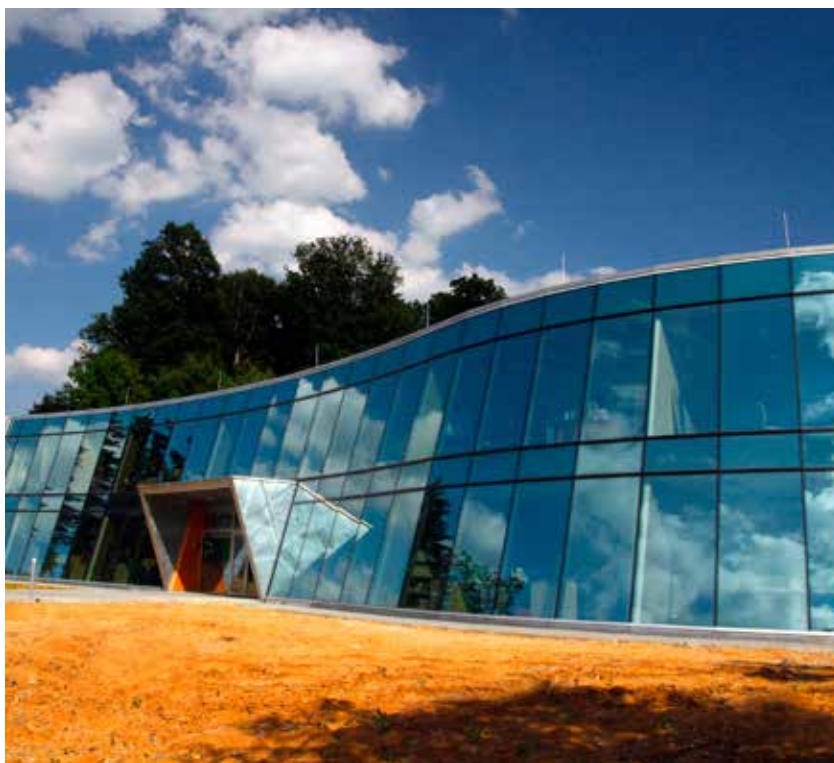
Office Building Lesy ČR - Zlín - Czech Republic - Stopsol Supersilver Green